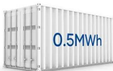
Standard 20ft containers